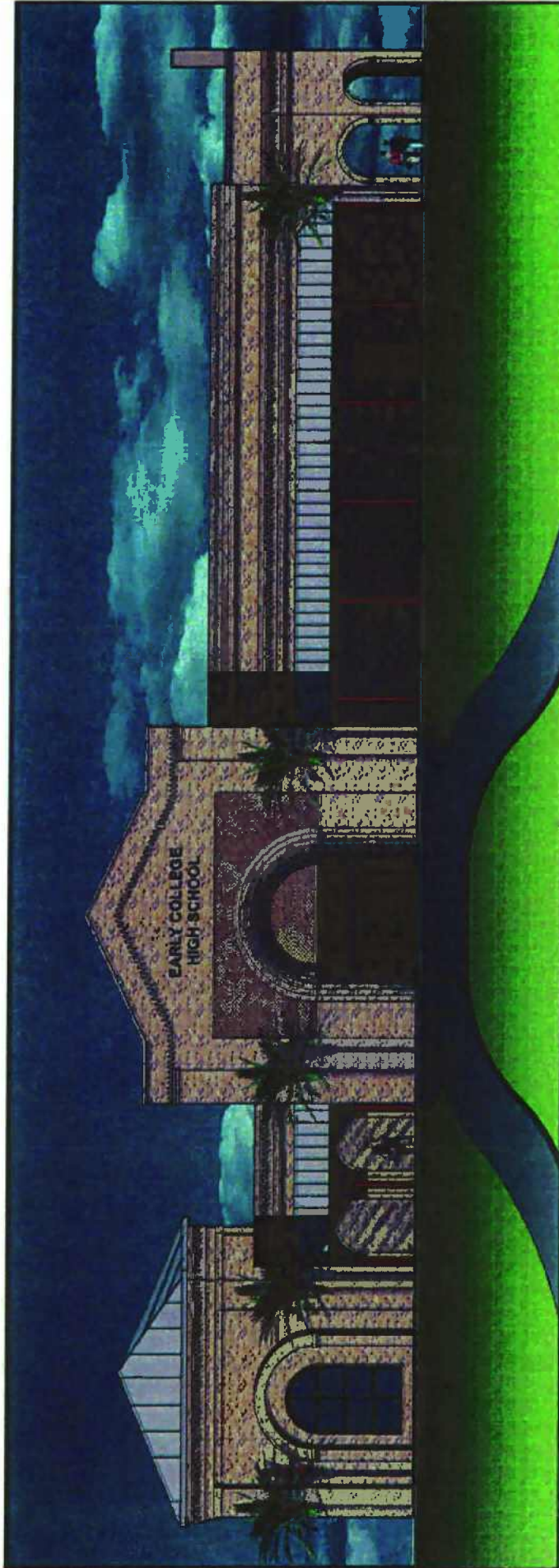
MAIN ENTRY ELEVATION (EAST SIDE)