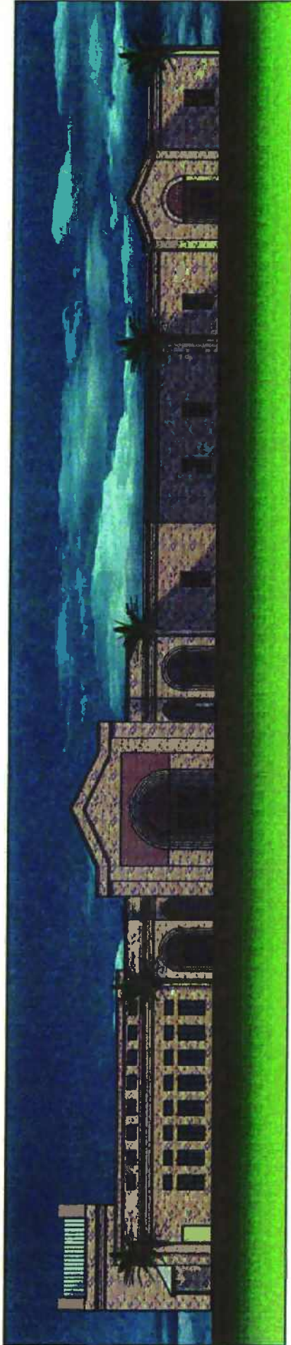
NORTH SIDE ELEVATION (FACING RESACA)