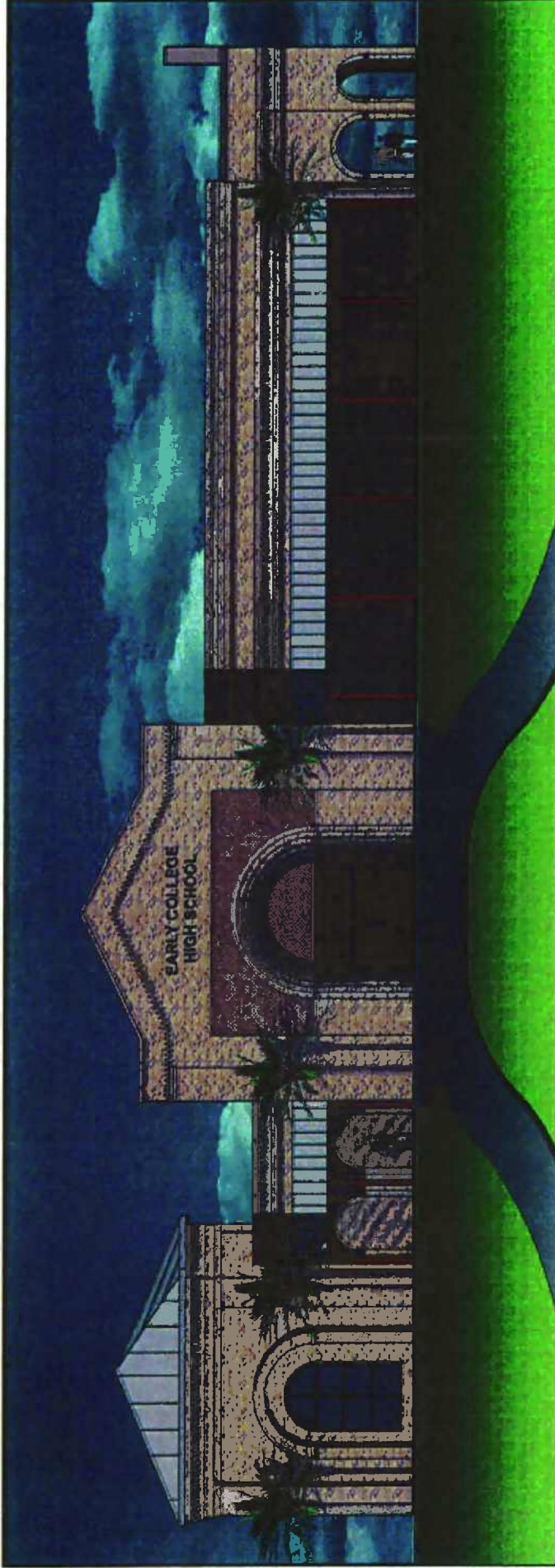
MAIN ENTRY ELEVATION (EAST SIDE)