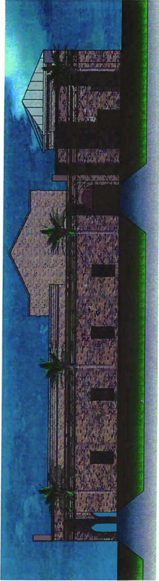
WEST SIDE ELEVATION ( NEALE DRIVE RD.)